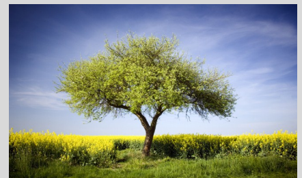
This is an on going series