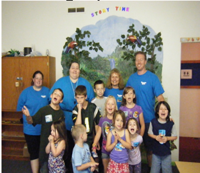
VBS GRADUATING CLASS OF 2011 WITH TEACHERS

Psalm 37: 16 & 18 (KJV) 16] A little that a righteous man hath is better than the riches of many wicked; [18] The LORD knoweth the days of the upright: and their inheritance shall be for ever