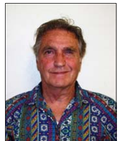
offered by Robert Camelli

In one study, astragalus was able to restore immune function in 90% of the cancer patients studied! And in 2 other studies, cancer patients receiving astragalus had TWICE the survival rate of those who only received standard therapies!