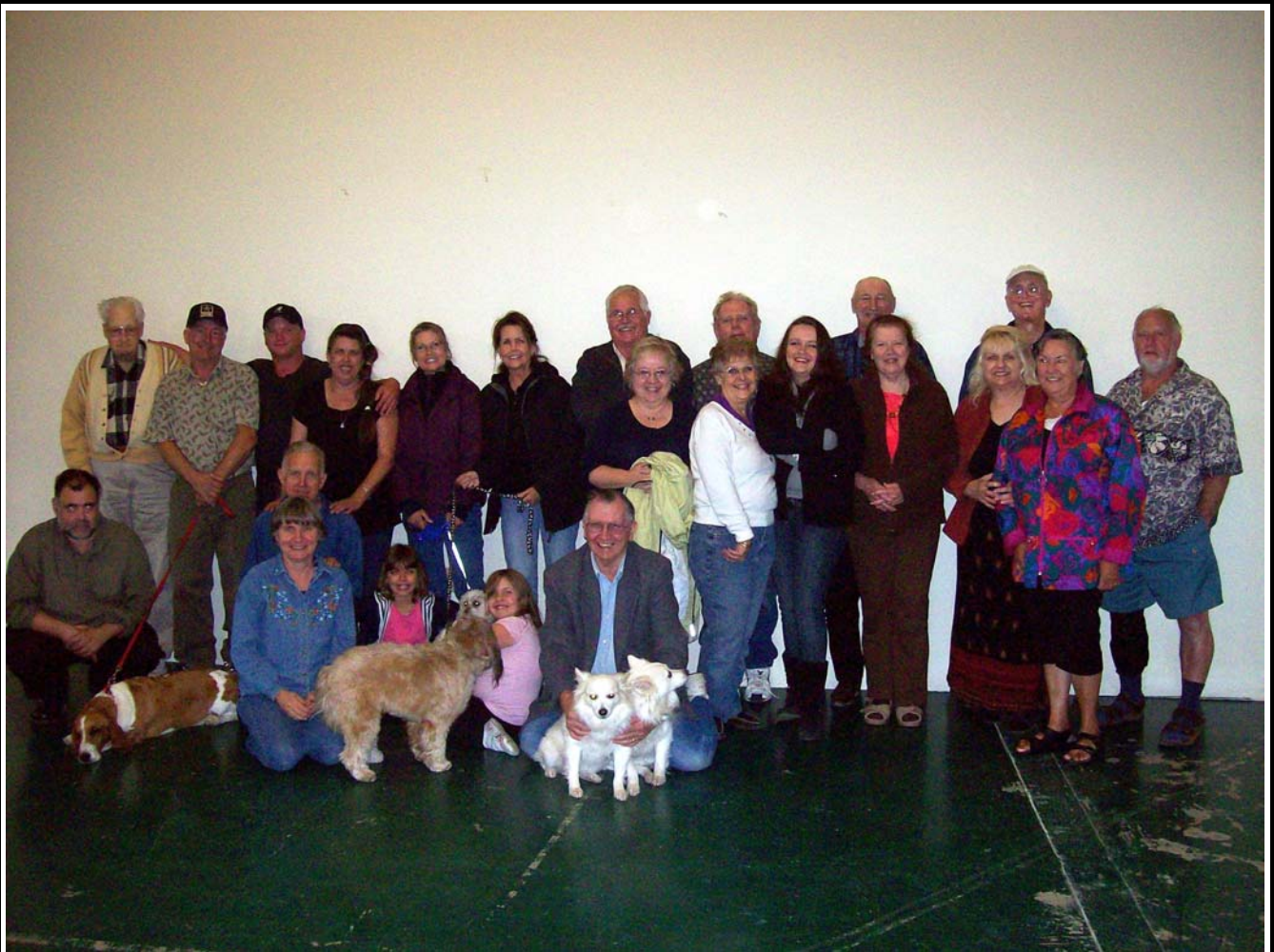
Church of God 7th Day, and guests (including the 4-legged kind [6 in all])

As you can plainly see, this group is a happy group! It would have been wonderful having the rest of our church family present at the time this photo was taken; but sometimes, that's just not possible. For those who were missing, you were indeed in our prayers and thoughts, as we enjoyed our outing.